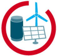
FOCUS AREA ENERGY