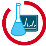
FOCUS AREA ANALYTICAL SCIENCES