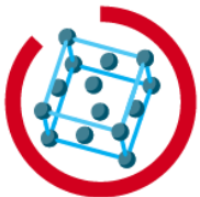
FOCUS AREA MATERIALS