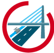
FOCUS AREA INFRASTRUCTURE